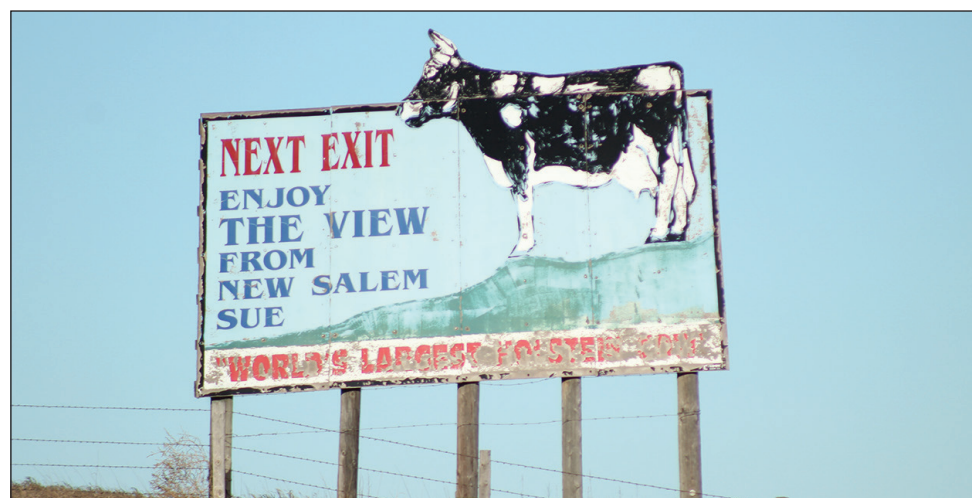
THE VISIBLE WEAR AND TEAR on the Salem Sue sign on westbound I-94 led to the decision by the New Salem Lions Club to purchase a brand new sign that will look fairly similar.