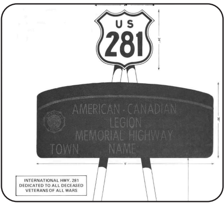
This 1975 graphic of a model sign, which places "American" in front of "Canadian" was included in the publication "Future of the Highway Program," a federal document submitted to the US House Committee on Public Works in the summer of 1975. The document can be found online at bit.ly/futurehwy

281 at Rolla, where it then runs southward to the southern border of the state, then through South Dakota, Nebraska, Kansas, Oklahoma and ends at the Mexican border near Brownsville, Texas. Signs carrying the Legion emblem in blue and gold and the "American Legion Memorial Highway," together with the name of the town and the name of the Legion Post, will be donated by various Legion clubs in the 10 North Dakota cities along Highway 281 which have American Legion posts. The signs will be placed inside the city limits and not on state or federal highway property. North Dakota communities involved in the project are Ellendale, Edgeley, Jamestown, Carrington, New Rockford, Sheyenne, Minnewaukan, Cando, Rolla and Dunseith.