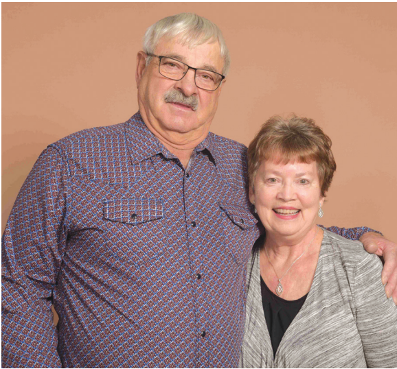
June 27, 2025

Happy 50th wedding anniversary Mom & Dad, Grandma & Grandpa. We love you!