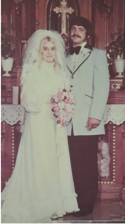
June 27, 1975