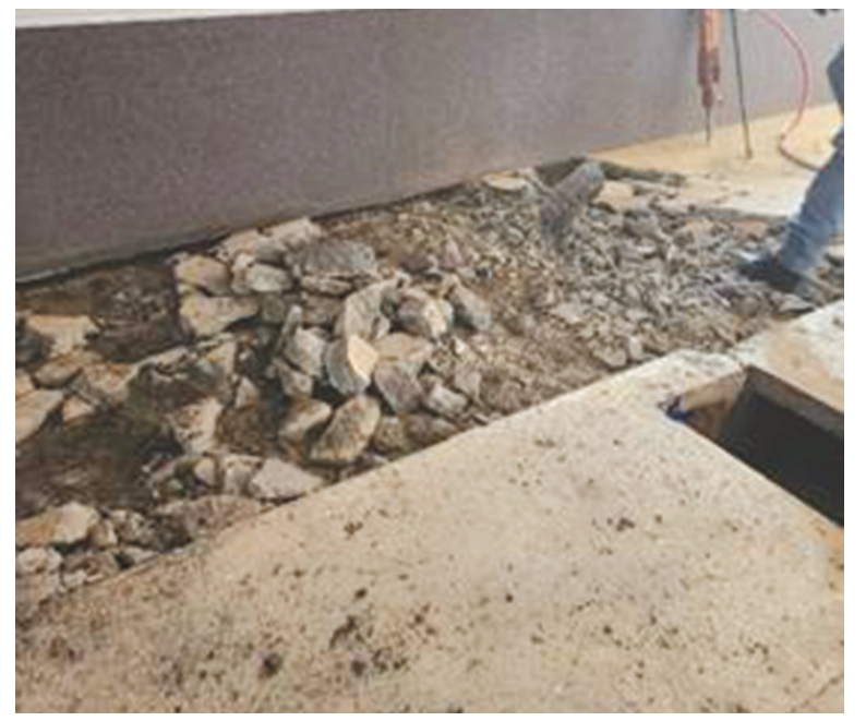
The floor in the basement of the city auditorium is being taken out along with the floors in the bathrooms in the down stairs.

Work is being completed by S & R Concrete & Construction LLC out of Bismarck.