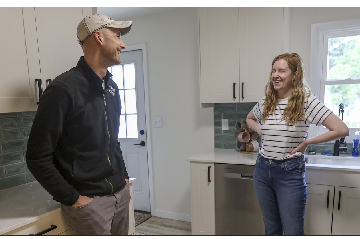
Alyssa Goelzer / The Forum