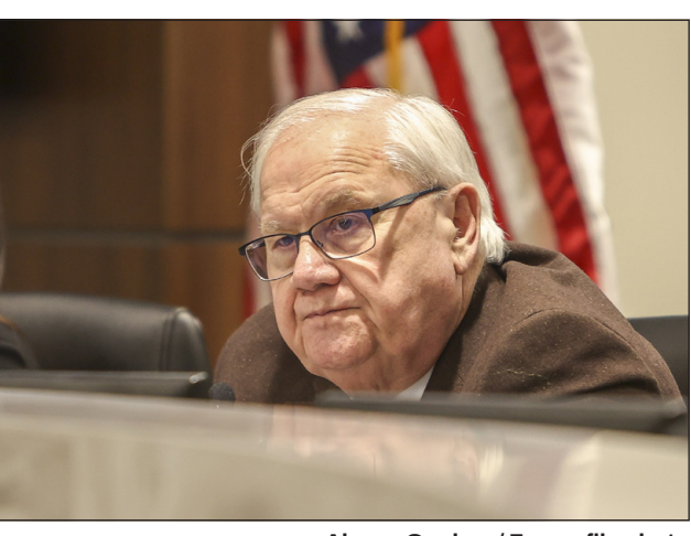
West Fargo Mayor Bernie Dardis at a West Fargo City Commission meeting in February.

West Fargo city commissioners initially asked staff in 2024 to draft an